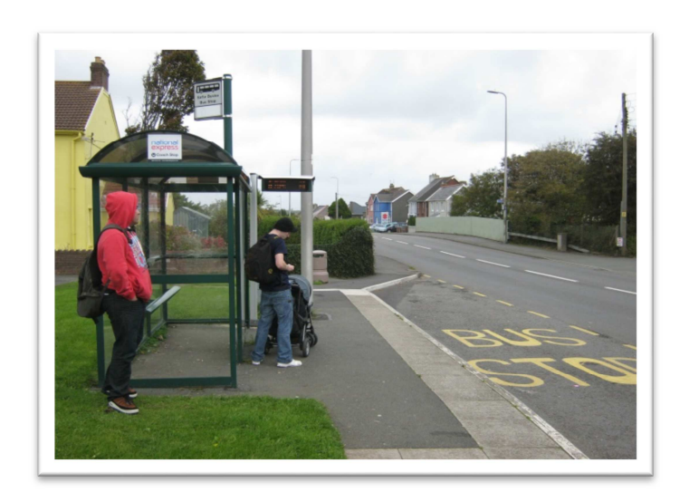
Photo above; Real Time Passenger Information system implemented in Johnston