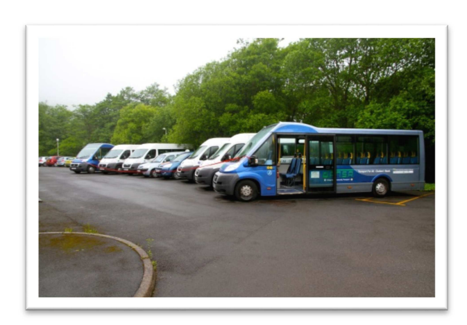
Photo above; Launch of the Western Valleys Community Transport Scheme

6.3 There were three specific stages of consultation as follows: