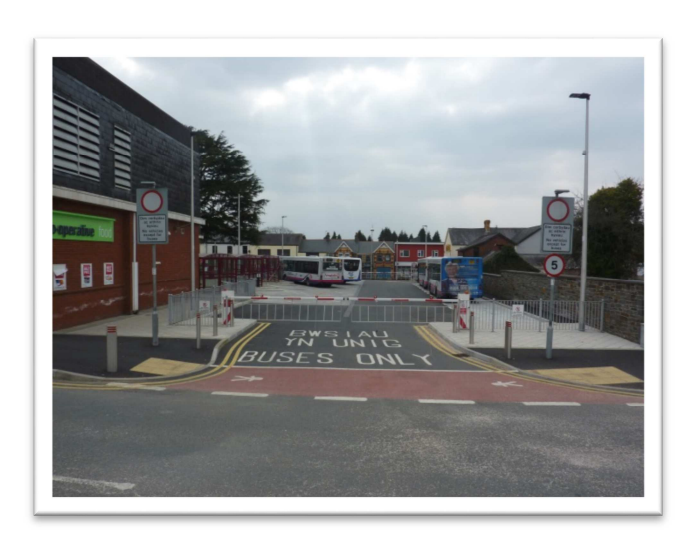
Photo above: Improvements to rural interchanges – Ammanford Bus station

5.3 A Non-Technical Summary of the work is shown in Appendix G and a copy of the SEA Addendum and an Appropriate Assessment Addendum are available on each Council's website. A summary is set out below: