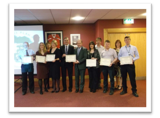
Photo left: South West Wales organisations receive their Travel Plan Awards