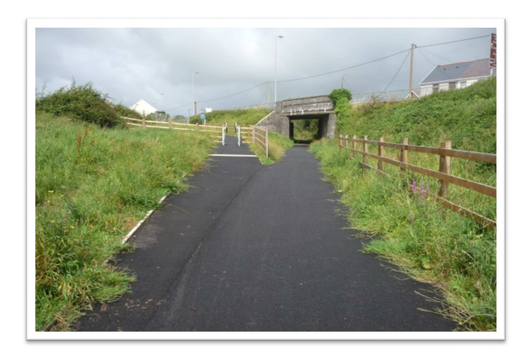
Photo above: Improvements to walking and cycling facilities in Carmarthen